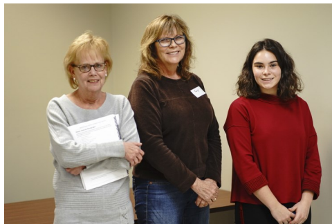
Pediatric Caregiver Support Workshop held in February 2020.